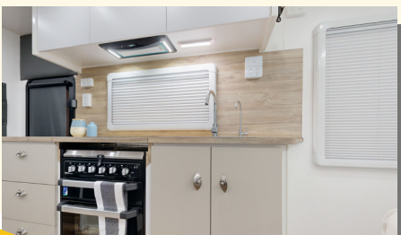
3 Gas & 1 Electric Plus Grill