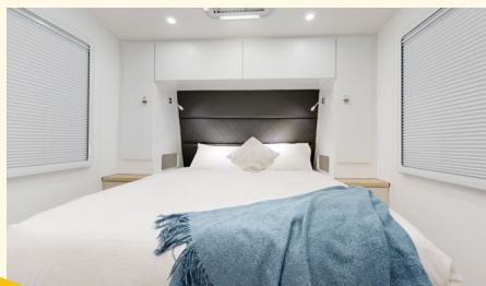
Queen Bed with Storage