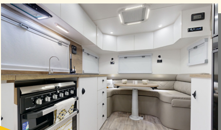
3 Gas & 1 Electric Plus Grill