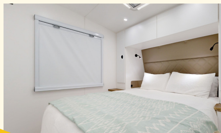
Queen Bed with Storage